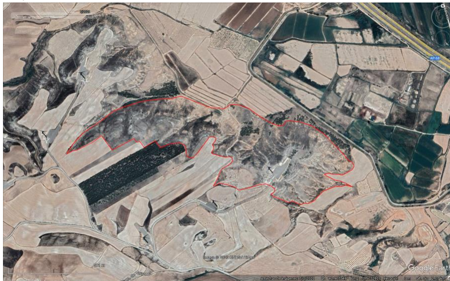
Figure 2. Google Earth images from different dates from 2020 and 2021.